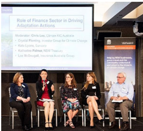
Panel discussion on the role of the finance sector in driving adaptation actions.